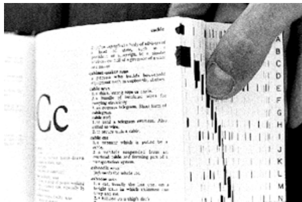
Illustration for U.S. Patent No. 4,813,710

What is the practical way to know what more words mean? Breakthrough U.S. Patent Number 4,813,710 gives an improved book dictionary that will be used more adequately because it is much easier to use. Find a word not with the usual 6 – 7 page turns, but with only 2 – 3 page turns. Here is an inexpensive priority program to help all subjects of study. Directions for use are in two videos listed after this article on the home page.